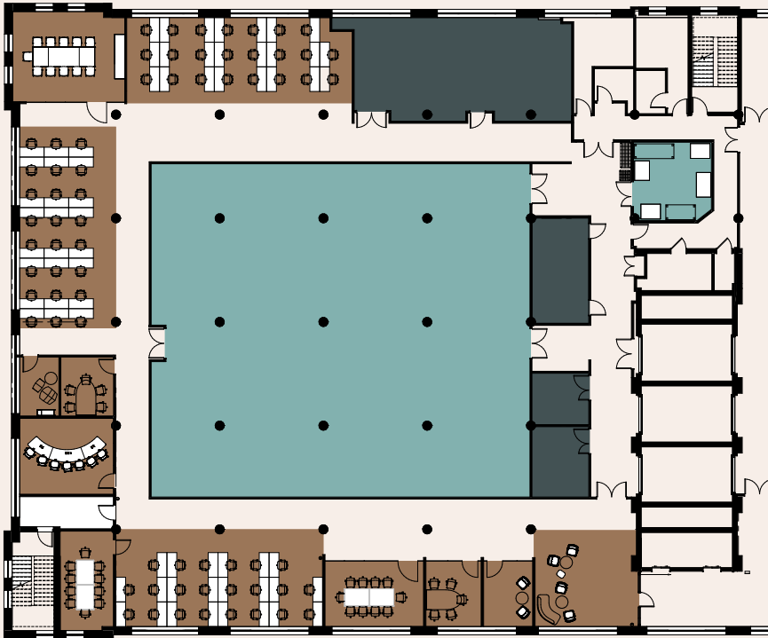
LEVEL 7 EAST 18,674 RSF PROPOSED LAB & OFFICE