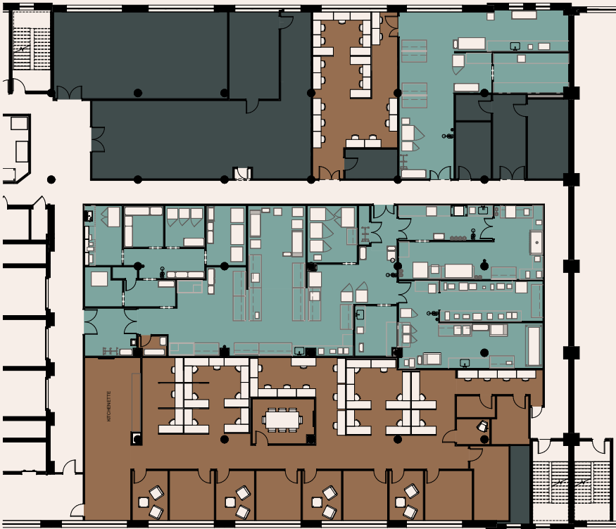
LEVEL 7 WEST 18,154 RSF PROPOSED LAB & OFFICE